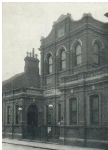
Leicester Road Wesleyan Methodist chapel