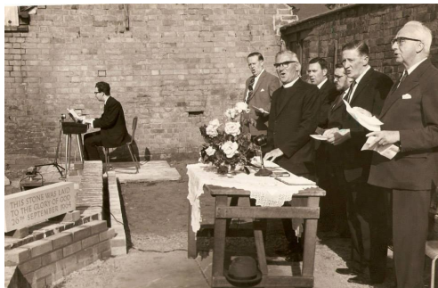
The laying of the foundation stone