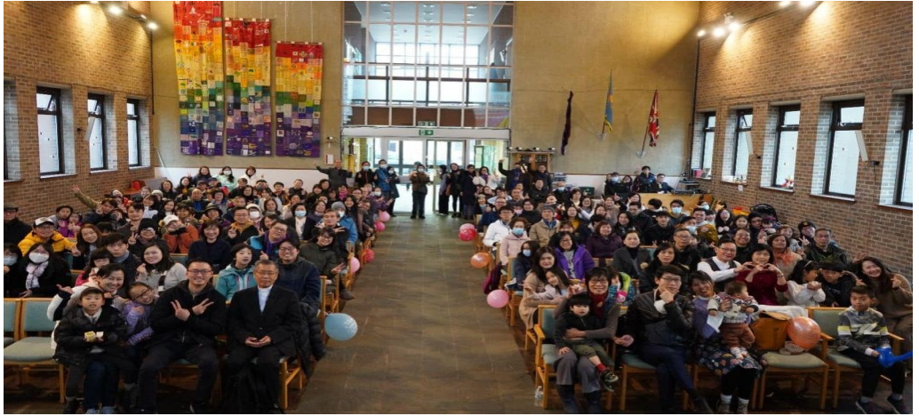
Chinese Church 11 th Anniversary 8 Jan 2023

The Chinese Christian community is the fastest-growing section of the Church in the UK, with a 29-per-cent growth in the Chinese Church in the past two years. 27 new congregations have been set up during this time to respond to the needs of people emigrating from Hong Kong (according to Bible Society research).