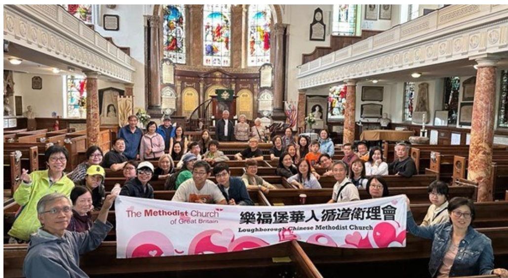
A visit to the Wesley Chapel at City Road London August 2023