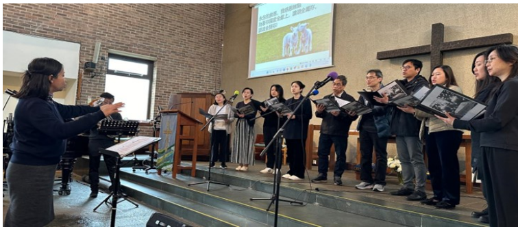
The newly set up Choir sang the anthem