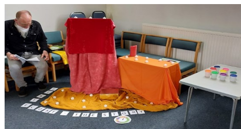
Pentecost the Story Display with playdough for making models