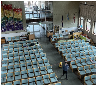
Trinity from on high

On the property we had a productive but fun day where we hired a scaffold tower and managed to fill a big hole running all the way up our stained-glass window. It gave a different view of Trinity. This should help to reduce our heating cost now that the draft has been cut out. We are also working towards reorganising our building to allow playgroup to use just the halls off the entrance way which will allow the rest of the church to be available for use at the same time as playgroup is meeting. A significant part of this is redesigning the room Teamprint used to use, and a meeting space that will be part of this will become known as the 'Richardson Room' in memory of Rev Sydney Richardson who was the founder and long term leader of Teamprint. Prior to work starting we will need to strip out some cupboards and work surfaces and if anyone could make use of any of this maybe in a garage or shed, please let me know andythorpe01509@gmail.com . Far better if these are reused than skipped.