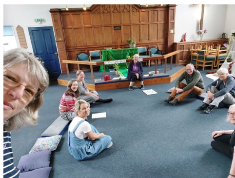
The Day 2 Team gathering for prayer before the children arrived