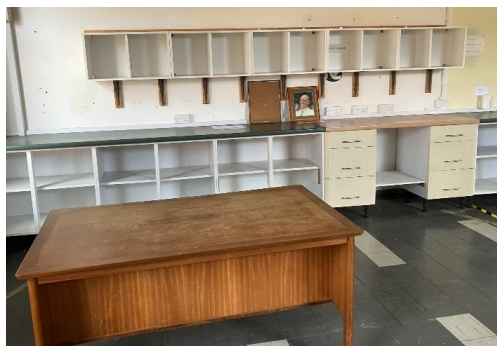
See example of items going spare

Looking forward we have Trinity's Harvest Festival on the last weekend of September. On the Saturday we will be having a Harvest supper followed by a Beetle Drive that anyone can come to join us. I also know Jazz Vespers is a service that is appreciated by others around the circuit so feel free to join us at 5:45 on 4 th August and listen to some very good music alongside a thought provoking talk.