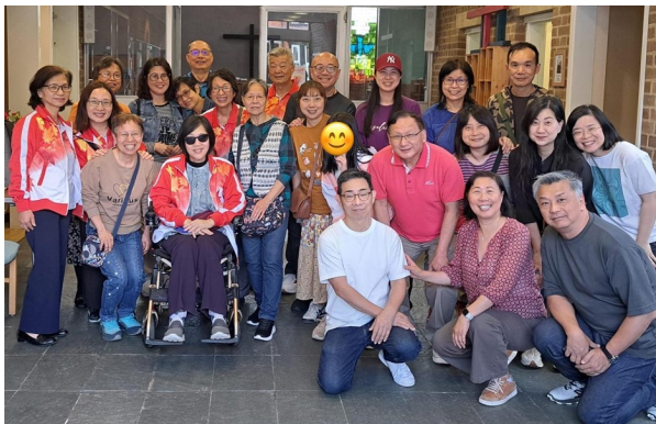
22 June 2024 Evangelical Tour from Hong Kong

January to June 2024 Y-Fire – Youth Programme every Saturday. We have recruited around 30 young people from Years 6 to 13 to join the programme. We plan to run this youth programme on Sundays from September 2024.