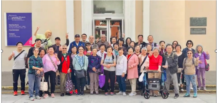
11 May 2024 the second Combined Senior Adults Fellowship at Leicester